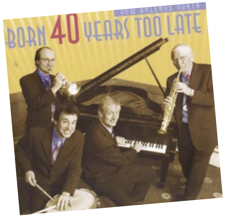
Born 40 Years Too Late, a loving tribute CD to Dixieland music by New Orleans North, will be officially released at the Yukon Arts Centre Sunday, Sept. 24, at 7:30 p.m. All proceeds will go to the Jazz Yukon Scholarship Program.