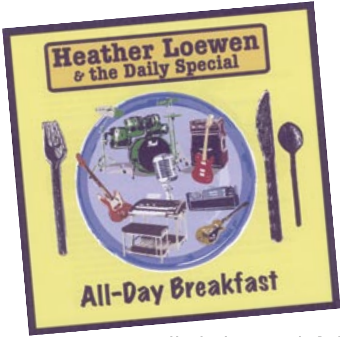
Heather Loewen & the Daily Specials, All-Day Breakfast is a full-meal deal.

After a successful CD release party a couple of weeks ago, Heather Loewen & the Daily Specials, All-Day Breakfast has hit the shelves.